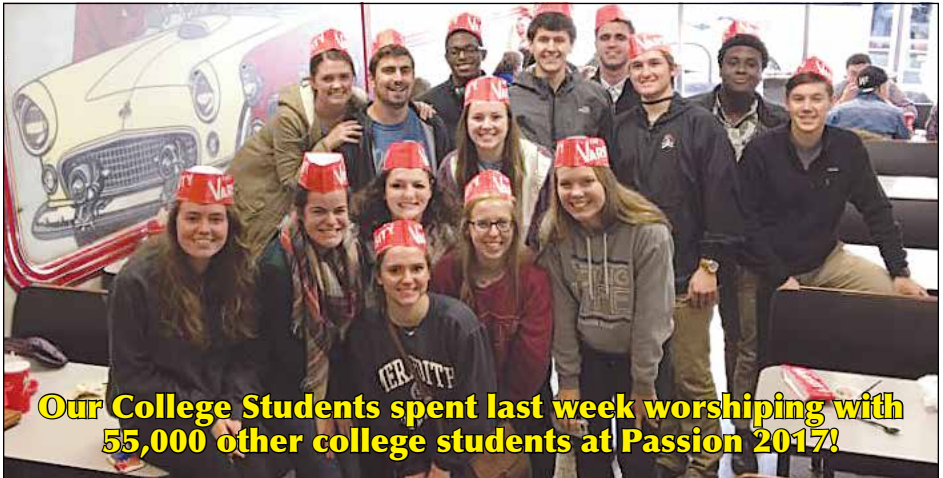
Our College Students spent last week worshipping with 55,000 other college students at Passion 2017!