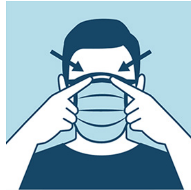
Fit snugly over and seals against nose, cheeks and chin