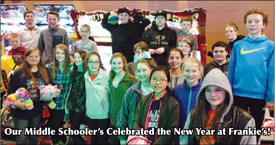
Our Middle Schooler's Celebrated the New Year at Frankie's!