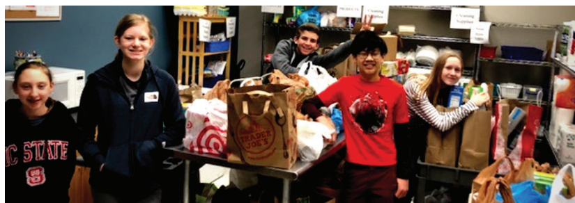
Middle school students delivered Trinity's food donation to North Raleigh Ministries during Middle School Missions in February.

Don't forget to follow North Raleigh Ministries on Facebook and Instagram for the most up-to-date information on how we can be Good News in our neighborhood!