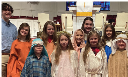
From Christmas Eve service 2022